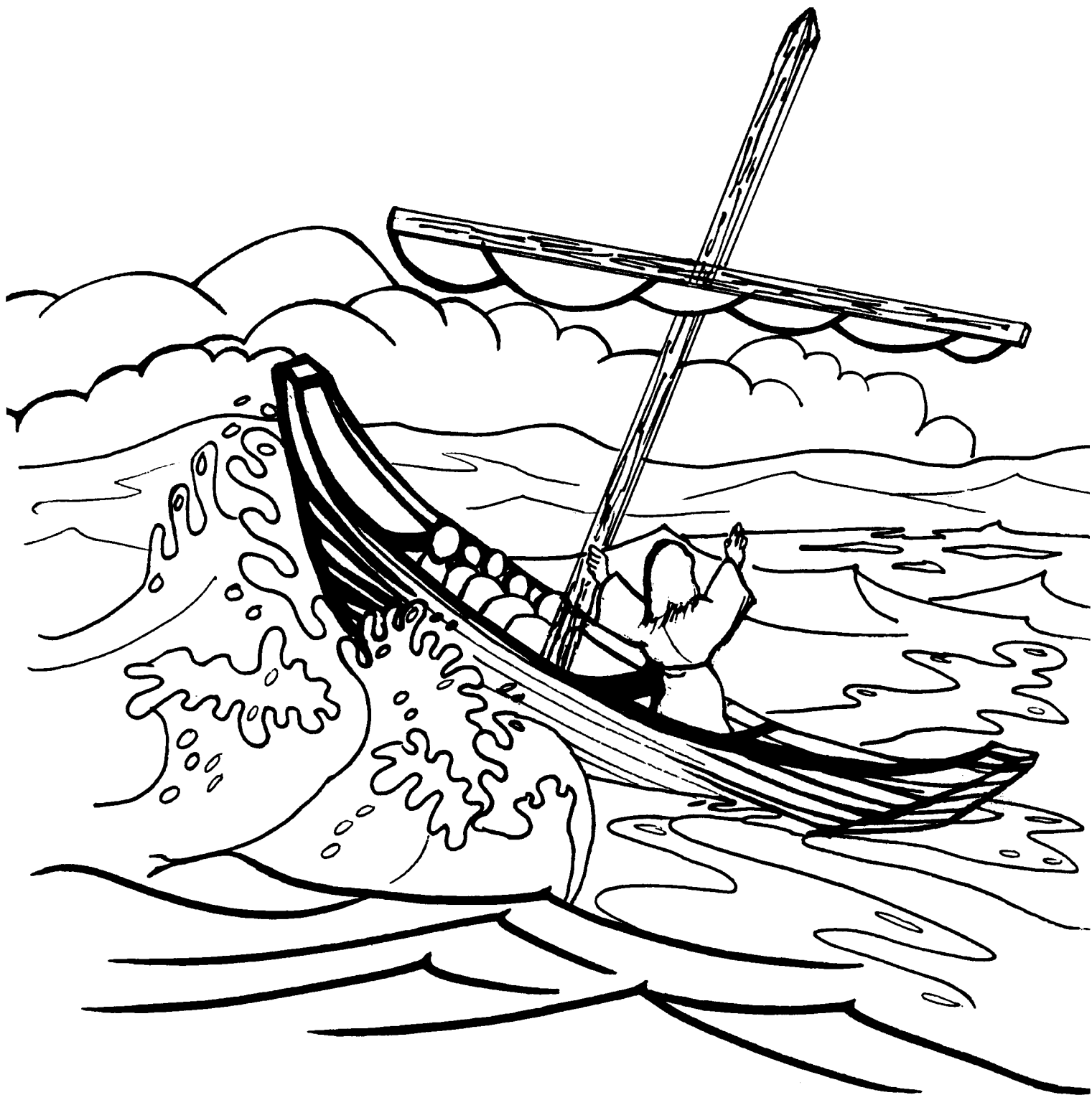
"Jesus calms a storm." Matthew 8:23 – 27